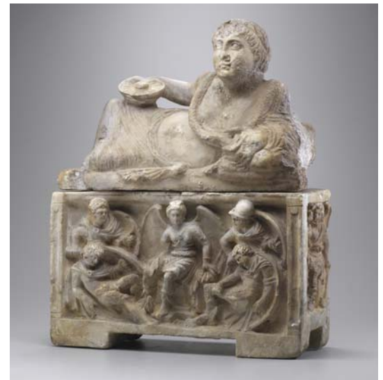
Cinerary Urn with battle scene between Eteokles and Polyneikes. Etruscan, late 3rd-early 2nd century BC. Founders Society Purchase, Detroit Institute of Arts