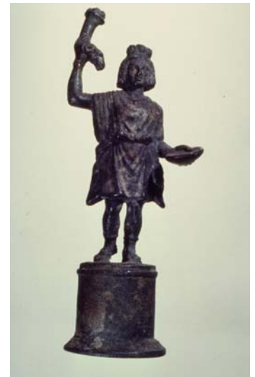
Statuette of a Lar, holding a cornucopia. Roman 2nd-4th century CE. Bronze. Kelsey Museum of Archaeology. On display at Art in Roman Life: Villa to Grave