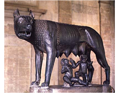
Etruscan bronze she-wolf from Capitoline Hill; sixth-fifth century BCE (twins, Romulus and Remus, added in Renaissance). Rome, Conservatori Museum.

Religion. The Romans gods best known to us are the Olympians, such as Jupiter, Juno, Mars, and Venus. But long before Romans adapted these Greek gods to their pantheon, they worshipped deities that inhabited local streams, fields, and woods. In addition, every household had a protective spirit named a Lar. And Romans, especially in a time of crisis, were not shy about importing the gods of other peoples, such as the Persian god Mithras or the Egyptian goddess Isis.