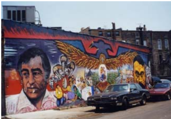
... and issues of gentrification and community in Pilsen.