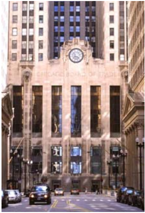
A global business center...