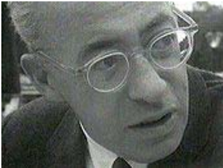
from Alinsky to Obama...