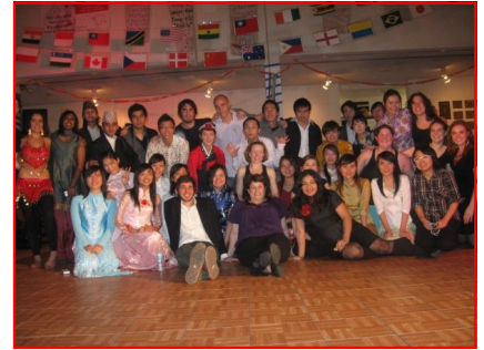
Students at Culture Show