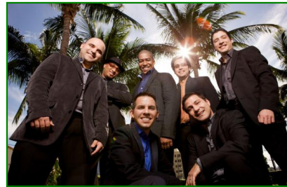
Tiempo Libre Band