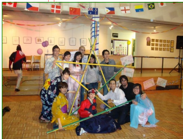
Students at Culture Show 2009

families. Eyes of the World then holds one of their most notable programs, a favorite among the Cornell campus, it