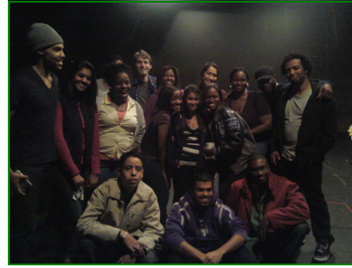
Students at Rock the Box

Culture Show Eyes of the World's annual Culture Show brought the campus together once again for a showcase of diverse cultural performances. This year featured new acts such as praise and belly dancing. The show performed to a full house, what a lovely way to begin family weekend!