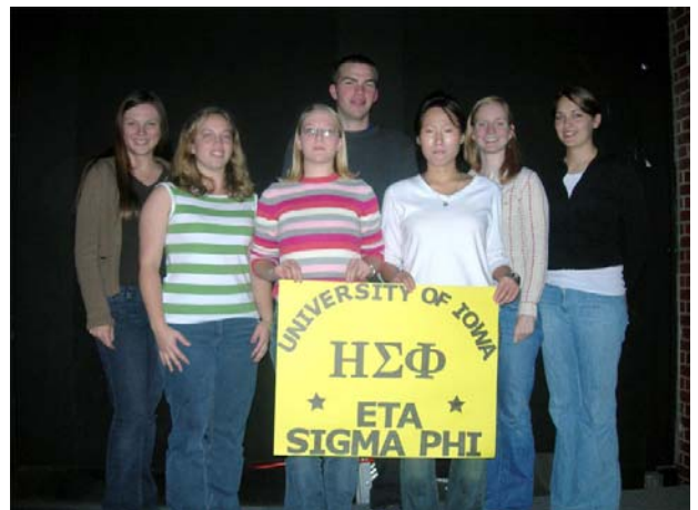
The Caristia website features this photo of University of Iowa students who are members of Eta Sigma Phi, the Classics Honorary Society