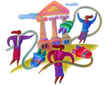
A grant to Classical Studies at ISU makes Latin available for everyone through cyberspace