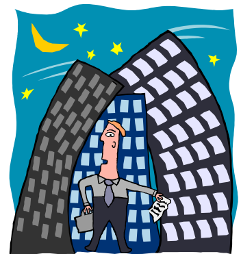
The University of Iowa will be offering beginning Latin at night

Iowa, and some of her TA's decided to do a reprise. In March 2006 several Classics graduate students will be giving the same presentation at the Iowa City Senior Center. The interactive presentation will include segments on conversational Latin, inscriptions, and graffiti.